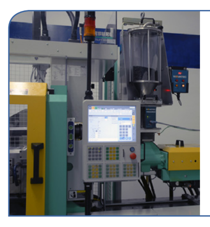
Small press mounted dryer for medical application

The interim move to a Central System for most processors is to introduce multiple portable dry/convey units. These dryers are usually mounted on a cart with a drying hopper, a loader or receiver to supply resin to the drying hopper and a machine-mount loader or receiver to deliver material to the machine throat. The throughputs range up to about 400 lb./hr. The bulk boxes and forklifts are still present - clogging up the production area. If multiple material changes are required, processors often have extra dry/convey units in an area off the production floor that