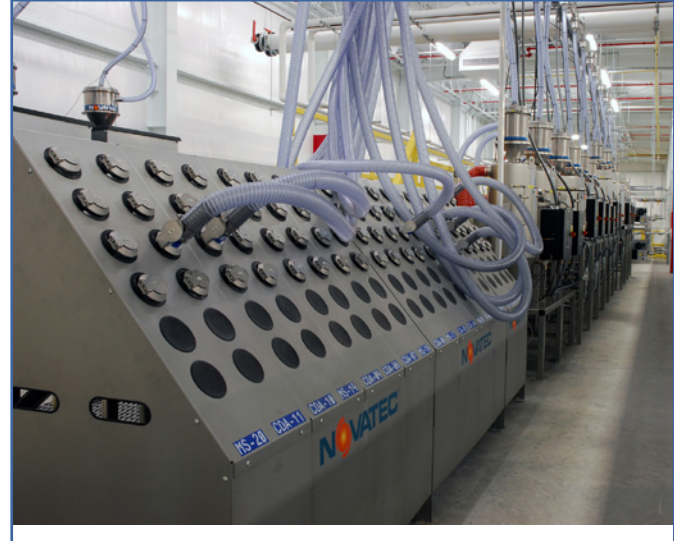
Auto ID validation eliminates molding the wrong material

A Central Drying/Conveying System can pull materials from a combination of silos, bulk bins and bulk boxes to drying hoppers, or blenders or a combination of those.