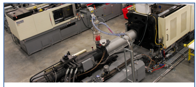
Unclog your production floor

Press-side dryers require about 75 sq.ft. per process machine for a dryer, hopper and a bulk box. Add the space a fork lift needs to move bulk boxes to and from the process machine and you are up to about 120 sq. ft.! Multiply that by the number of presses you have to see how many additional presses you can add – so you can increase your manufacturing area – where profits are made.