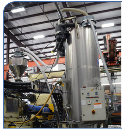
Portable Dry/Convey Model