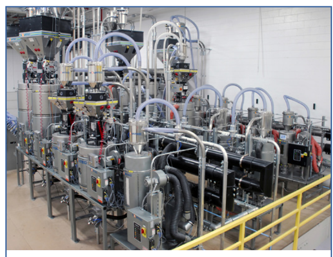
Compact Drying, Blending and Conveying area