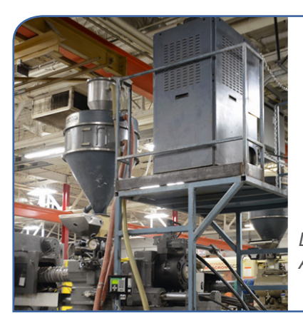
Dryer Mounted Above Press